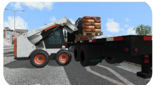
Load/Unload a Flatbed Truck