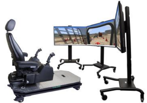
Setup with 1 Front Display or 3 Front Displays

Simply install the simulation software and connect the USB simulator controls!