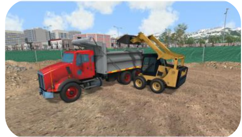
Load a Dump Truck