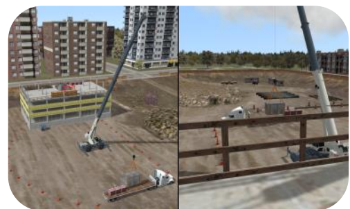
Signal Person Views

A fixed view of the lift area, with the crane, load and target visible. A dynamic view that follows the movement of the load.